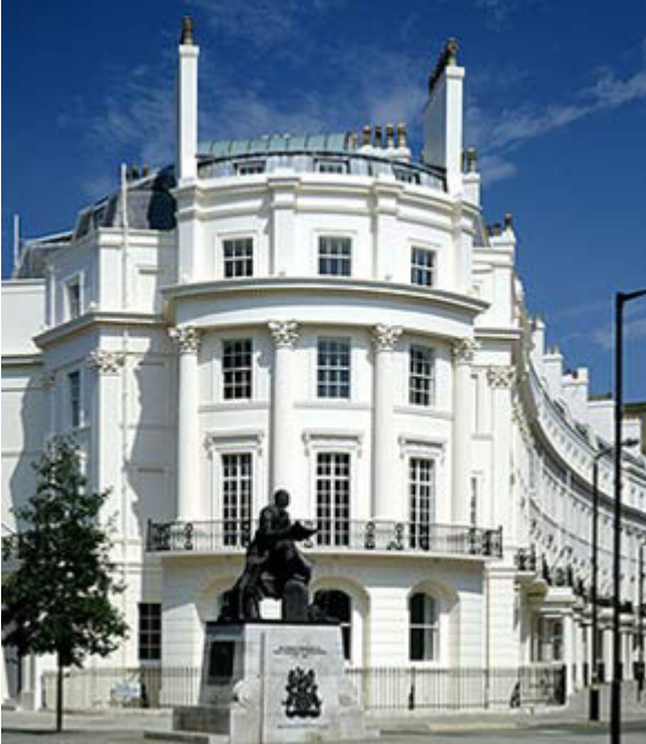
London Office No. 1, Grosvenor Crescent

We provide architectural, engineering, financial and management expertise for the construction industry. THE WHEATLEY COMPANIES (SM), together with our network of Strategic Partners, WHEATLEY GLOBAL PARTNERS (SM), offer: